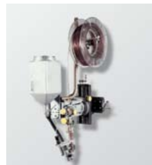
A6S Arc Master basic version with manual slide, a complete welding head with easy-to-use 4-axis positioning on the joint.

The beam travelling carriage can be used together with the complete A6S Arc Master. The carriage is developed to be used on a standard I-profile IPE 300. When a straight and smooth welding motion is required, the machine track produced by ESAB can be used. The travelling speed will be controlled by the control box PEK. The carriage can even be moved by hand. See separate leaflet XA00091920.