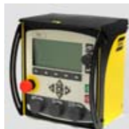
PEK an advanced control unit with numerous features: