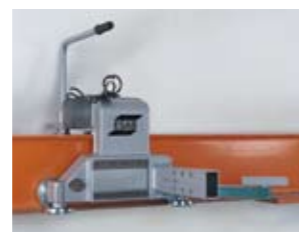
Beam travelling carriage