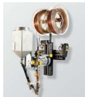
A6S Twin Master for highly productive fillet or butt welding, also on light-gauge material.