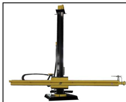
CAB-VHD with Fixed stand

Note: All specification and dimension are subject to change without further notice. All Equipment comes without Power Supply Cable.