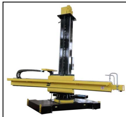
CAB-VHD with Motorised Carriage